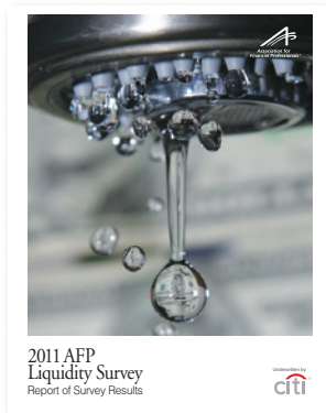
Survey Report Cover