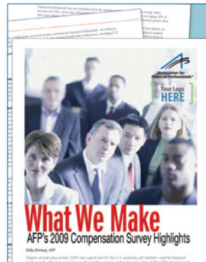
AFP Exchange Articles