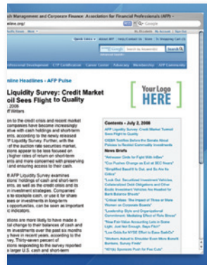
AFP Website Posting